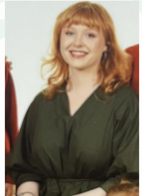
Miss CB Class Support